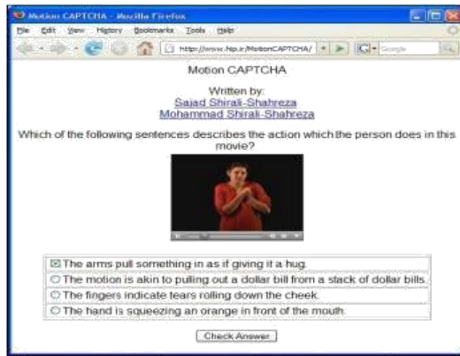
Figure 4: Example of a Motion CAPTCHA