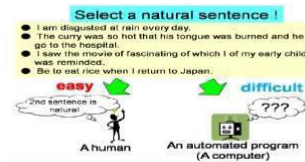
Figure 3: Bongo Method

This form of CATCHA allows the user to overcome user authorisation with a visual pattern recognition problem. Boxes in series are shown, one at the left and one at the right. The boxes to the left are different from those on the right and the user would recognise among that two boxes. Shows an example of system Bongo.