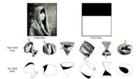
Figure 5: Example of Multiple SEIMCHA

A CAPTCHA semantic image has several degrees of complexity in choosing a specific object in a Picture to define the upright picture orientation which is difficult for computer programs. In the paper Gossweiler et al first introduced the simple idea behind this CAPTCHA "What's up with CAPTCHA" where the user and a series of randomly rotated images were displayed The image was required to rotate until it was positioned upright.